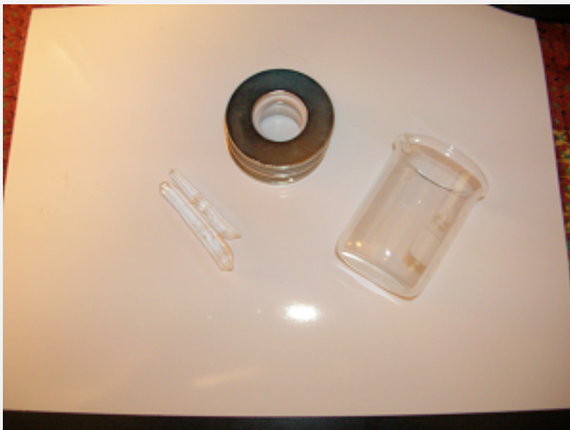
50 ml beaker, magnets, quartz crystal points

50 ml beaker, ring magnets, and quartz crystal.tif (150.73 KiB) Viewed 5505 times